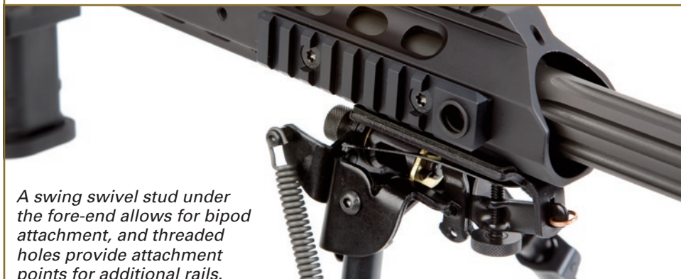
A swing swivel stud under the fore-end allows for bipod attachment, and threaded holes provide attachment points for additional rails.

I used four brands of ammunition to evaluate the Barrett: a 250-gr. Sierra MatchKing load from Black Hills; a Lapua 250-gr. Lock Base FMJBT load; a Lapua 250-gr. Scenar HPBT load; and a 250-gr. HPBT Swiss P Target load from RUAG ( www.ows.ammo.com ). According to Barrett Firearms, Black Hills' 300-gr. Sierra MK load also works very well in the Model 98B, and is used as the